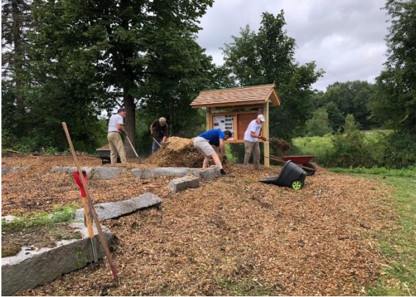
NHLT Volunteers work on trail and land management nearly every week at various properties. Above, 'pitching in' at the Alfred Sabolcik Preserve on Sabolcik Road.