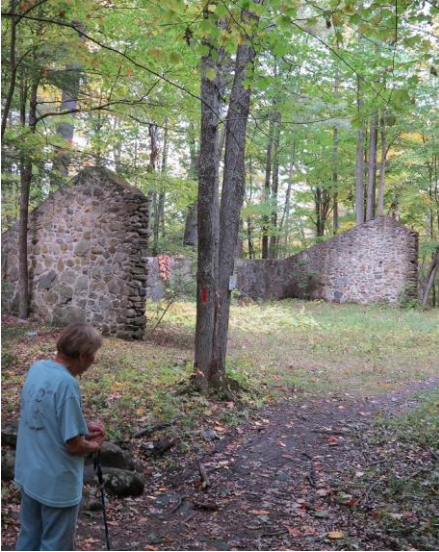
NHLT Preserves Jones Mountain Parcel to Secure Future of Trail System

NHLT has been really busy! Over the past two years, we have preserved some of the most significant natural places in New Hartford for public access hiking trails, habitat and to protect water quality. We hope you are walking on or viewing these very special places. Our volunteers work hard to maintain NHLT's owned properties with public access. There are more conservation projects in the works and they all meet the highest criteria for preservation-worthy lands. Below are NHLT's 2019-2020 top highlights.